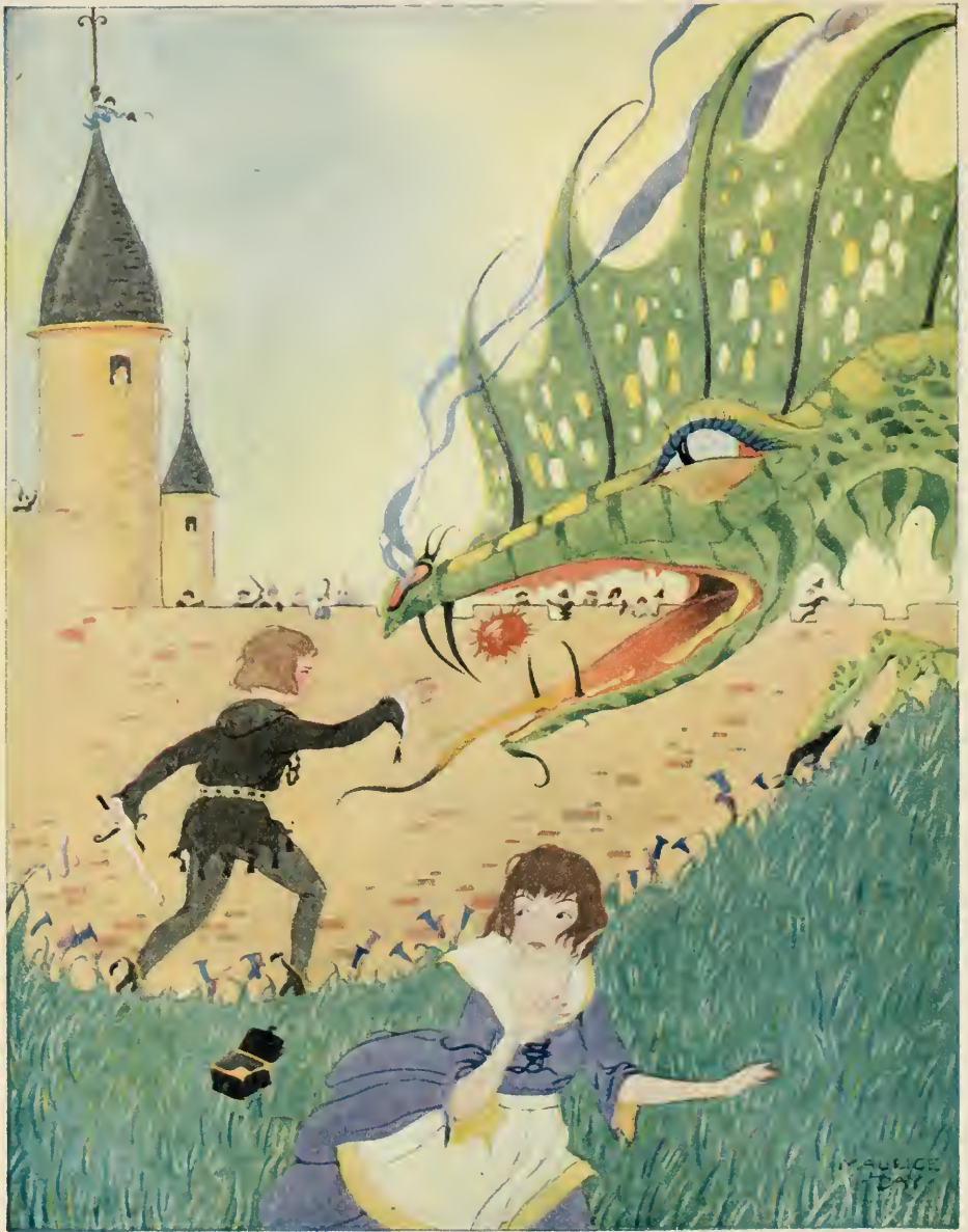
Just as the dragon's mouth was at its widest . . . .